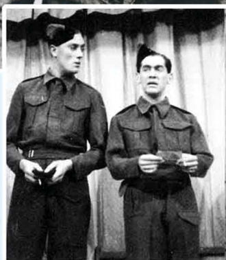
Tony Hancock (on right)

The RAF established ‘RAF Gang Shows’, under the direction of Somerset-born Ralph Reader, the format of which is still popular with Scouts & Guides Associations.