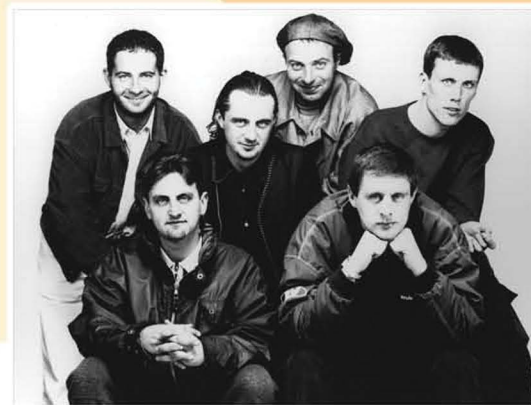
The Happy Mondays