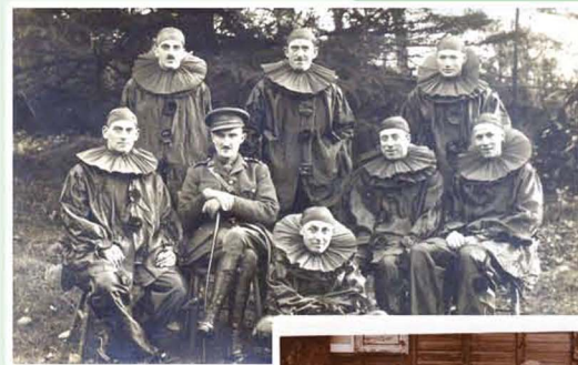
The Gloucestershire Regiment

This enabled performances at distribution centres and hospital stations, but the conflict areas were too dangerous for civilians, so the soldiers and sailors often created their own troupes: the contemporary comedian Lee Mack's great grandfather 'Billy Mac', performed with 'The Optimists' whilst fighting at the Battle of the Somme!