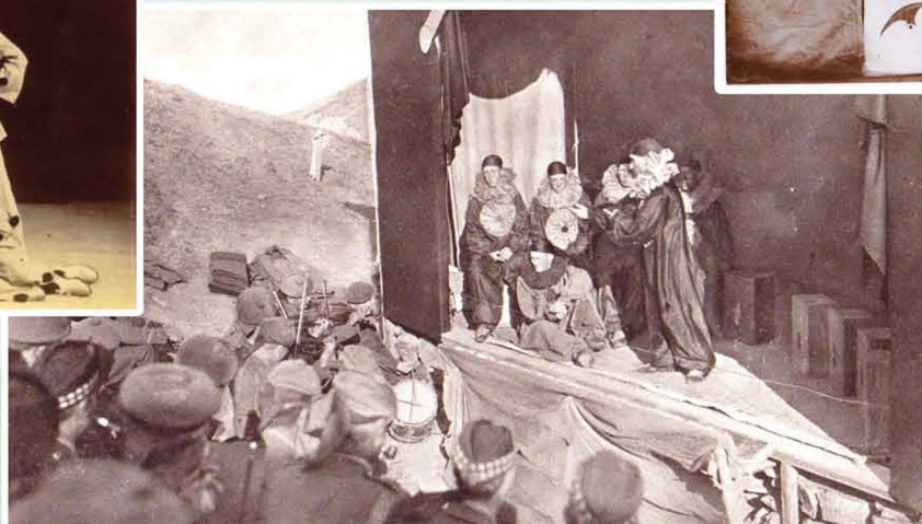
Pierrots entertain Scottish troops at Salonika, May 1916