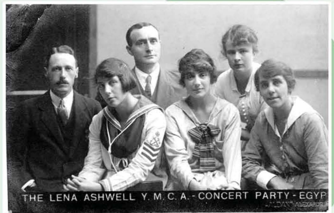
THE LENA ASHWELL Y. M. C. A. - CONCERT PARTY - EGYPT

Troupes & concert parties were organised, to raise money for the troops fighting overseas, by philanthropic individuals, such as the actress Lena Ashwell.