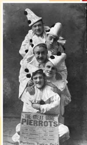
The Great Orme Pierrots